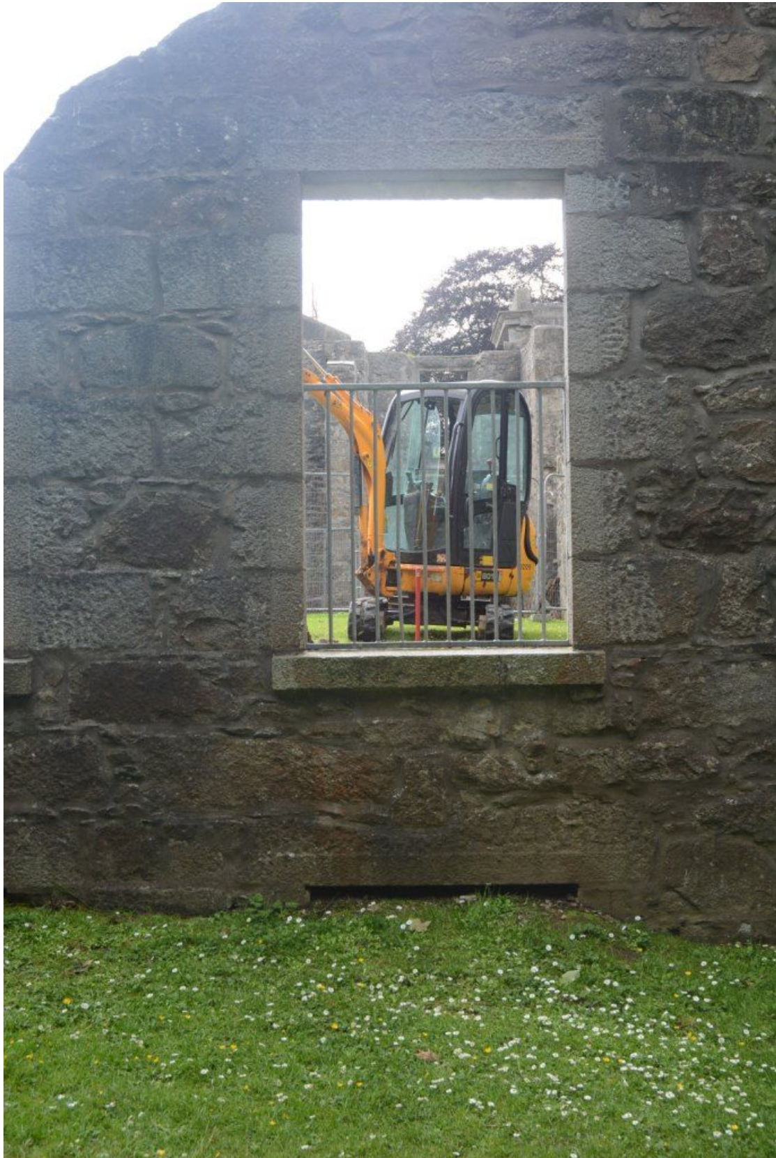
Illus 20 Location of TP3 in relation to window and vent in N wall of Small Pantry