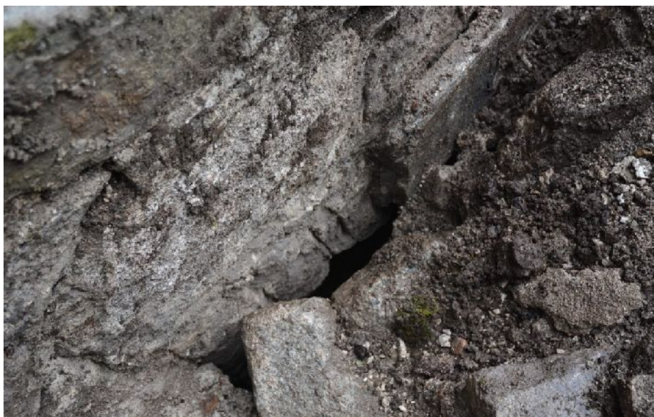
Illus 13 Detail of arch built into base of wall

Six brick pillars were set below the edge of step 5 (Illus 2: B1-B6, Illus 8). B1 and B6/7 extended as narrow wall facings on the E and W walls below floor level (to cellar level). Two of the intervening pillars (B3 and B4) also appear to have extended at least to the I-beam. Of particular interest is B7 which was very clearly built to the I-beam and extended between the upper and lower flanges- the bricks had to have been put in, or at least extended/repared after the I-beam was in situ.