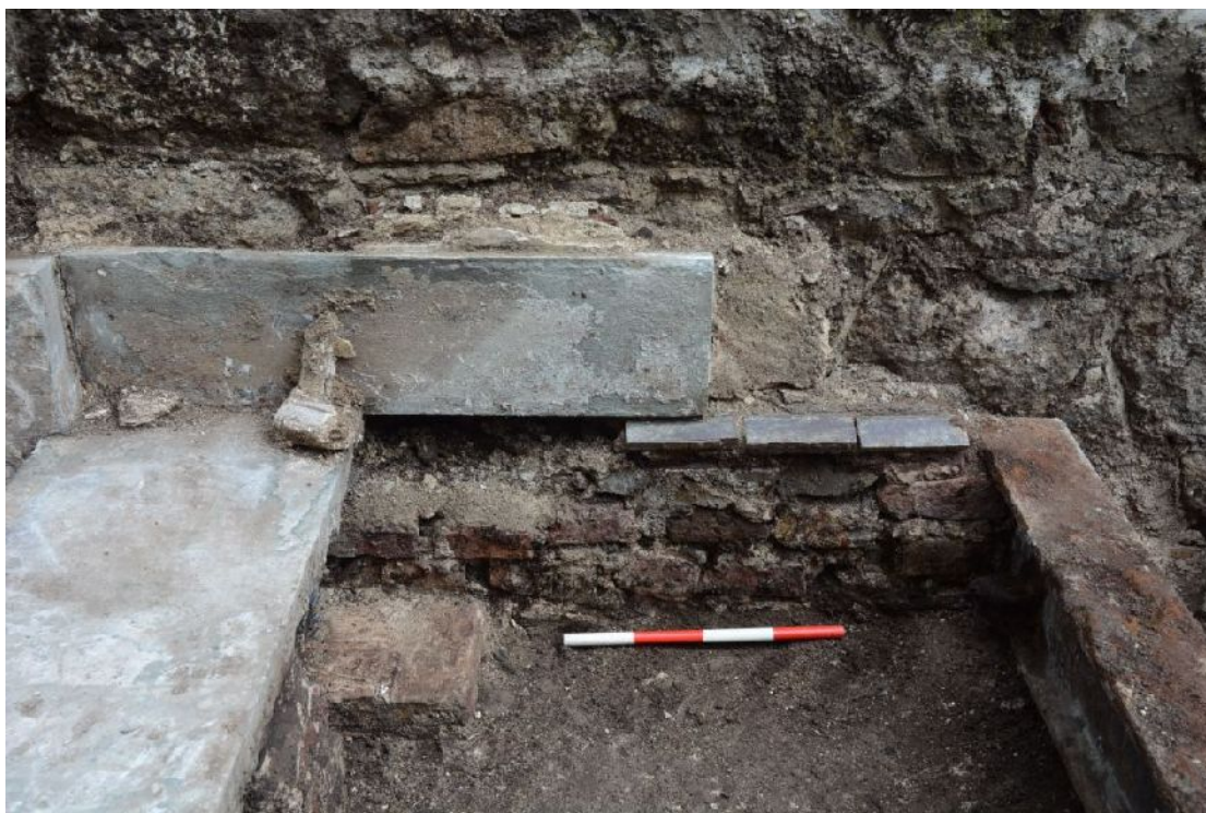
Illus 9 W side of area N of step 5 (LHS) showing stratigraphy of wall plaster on slate skirting over border tiles laid on brickwork which is built in between flanges of I-beam (RHS)

The upper part of the Entrance Hall, N of step 5, had been in-filled with compact rubble stone and mortar debris, with small voids which could be probed to c.1.5m depth. A few pieces of timber projected vertically from the infill. A number of ceramic tile pieces lay in the fill- all were of tiles that would have fitted the same pattern that was recorded S of the steps. Three edging tiles lay in situ alongside the W wall, set on a mortar base that was laid on a brick wall facing alongside the stone wall at this point (Illus 2: C, Illus 9). Part of the wall plaster was in situ on the slate skirting above the tiles.