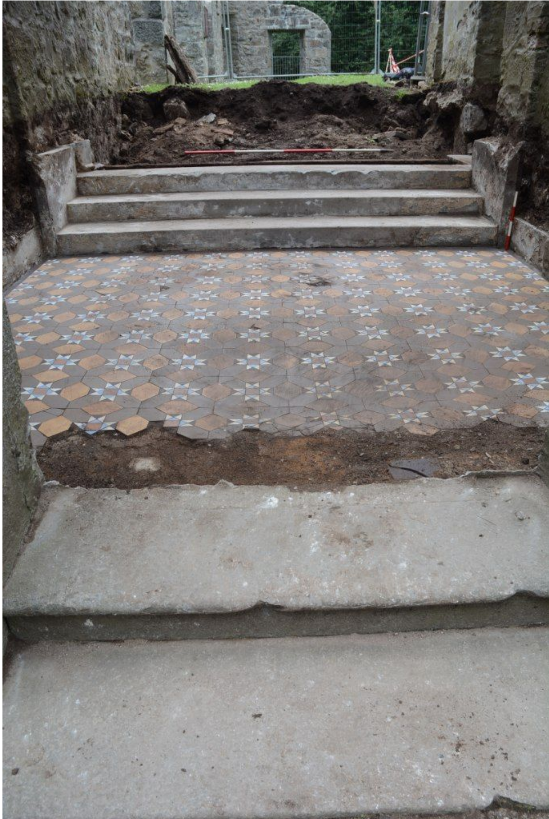
Illus 4 View of tiles in lower area of Entrance Hall, looking N