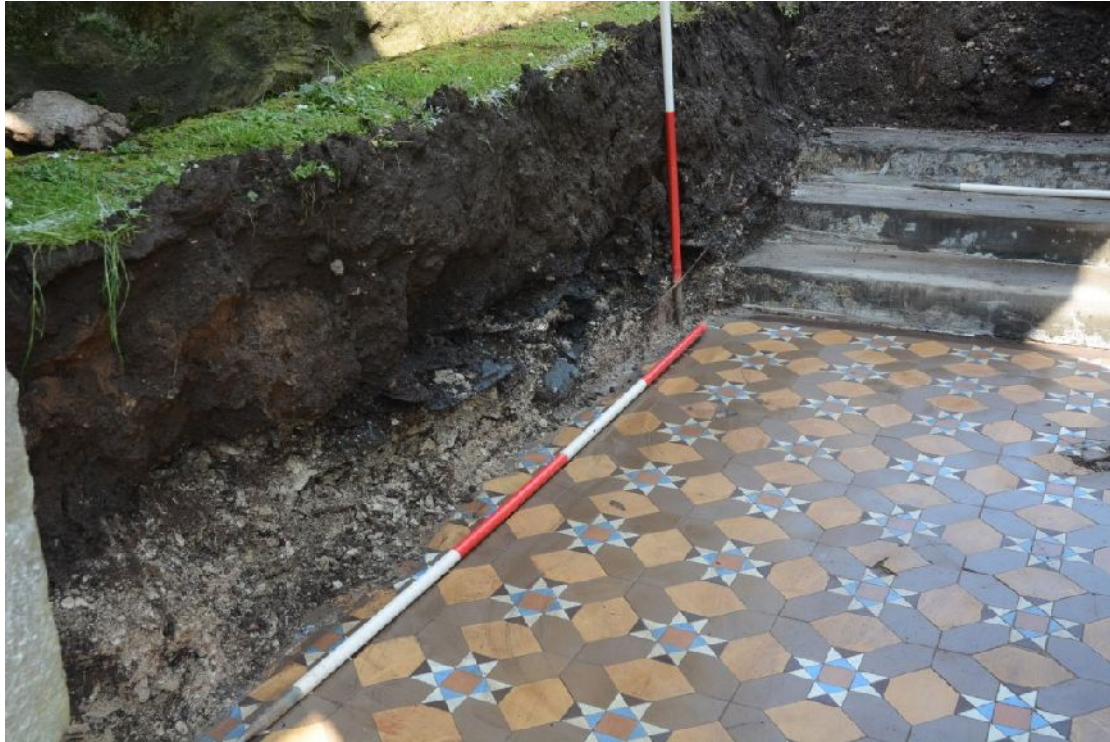
Illus 3 Detail of overburden beside W wall of Entrance Hall. July 2 nd 2015

The outer granite steps had rolled outer edges, with step 1 having curved outer corners fitting to the front wall of the building.