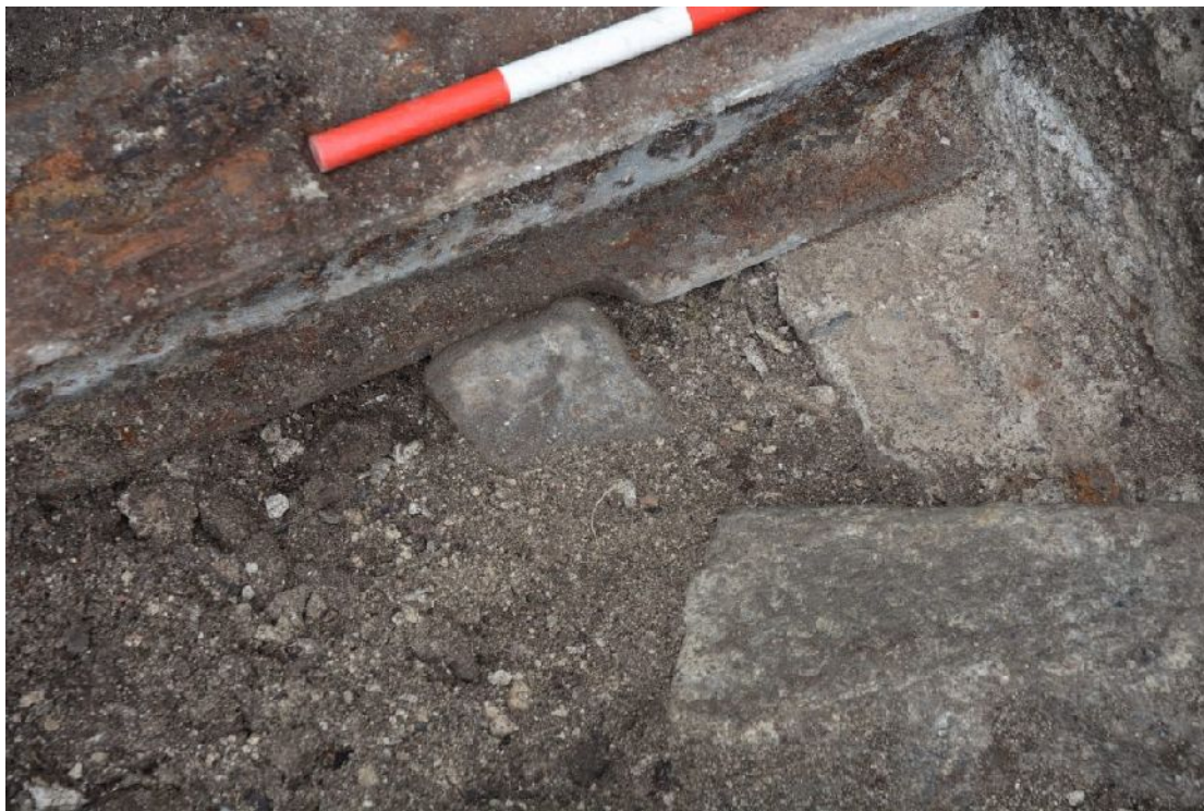
Illus 10 W end of I-beam supported on stone wall. Shows notched lower flange.