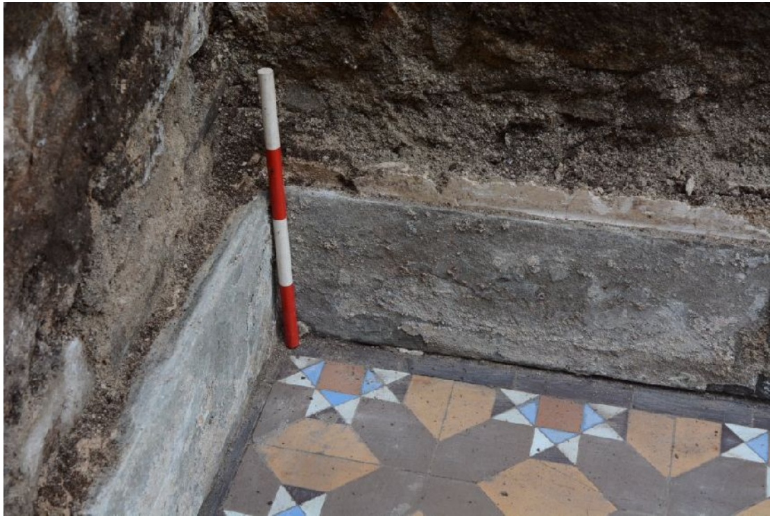
Illus 6 Detail of SW corner of lower part of Entrance Hall showing stratigraphic relationship of tiles, slate skirting and wall plaster