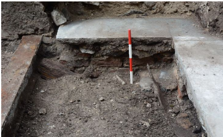
Illus 12 Detail of E end of I-beam slotted into main wall. Note vertical timbers in building rubble infill.

Six brick pillars were set below the edge of step 5 (Illus 2: B1-B6, Illus 8). B1 and B6/7 extended as narrow wall facings on the E and W walls below floor level (to cellar level). Two of the intervening pillars (B3 and B4) also appear to have extended at least to the I-beam. Of particular interest is B7 which was very clearly built to the I-beam and extended between the upper and lower flanges- the bricks had to have been put in, or at least extended/repared after the I-beam was in situ.