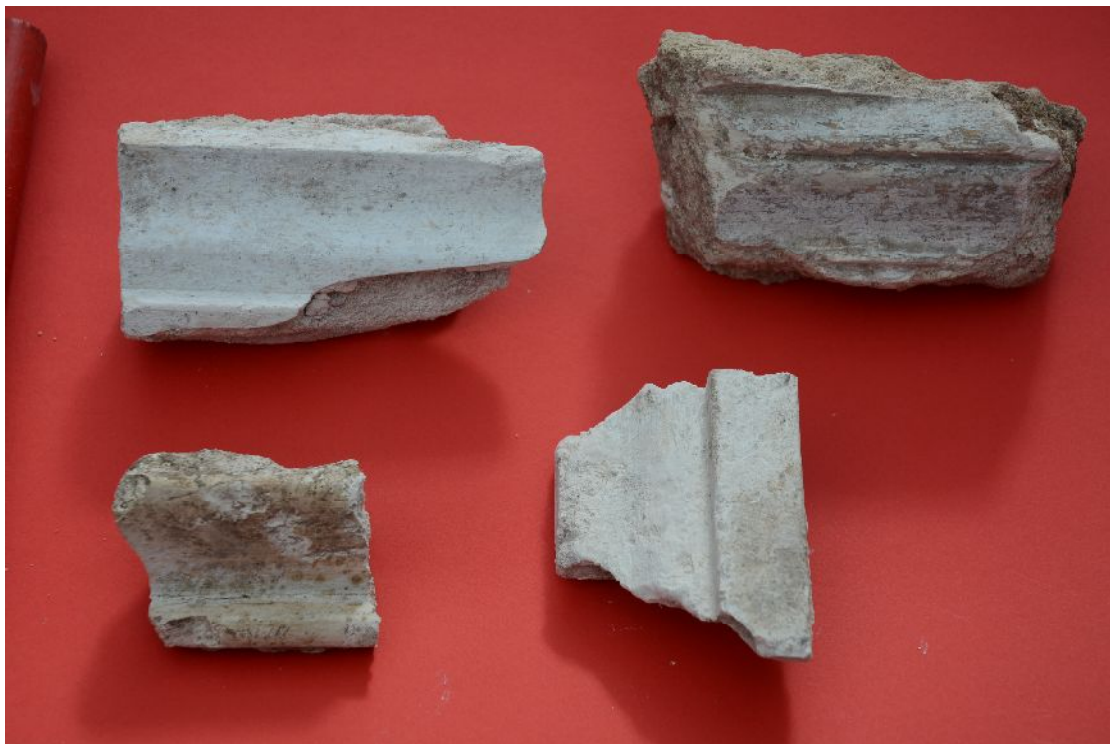
Illus 7 Detail of moulded plaster fragments from building rubble in Entrance hall