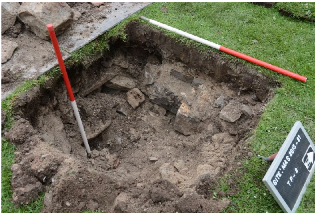
Illus 17 Section of TP2