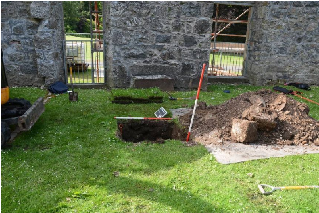
Illus 14 Location of TP1, looking S

This area did not appear to have been cellared.