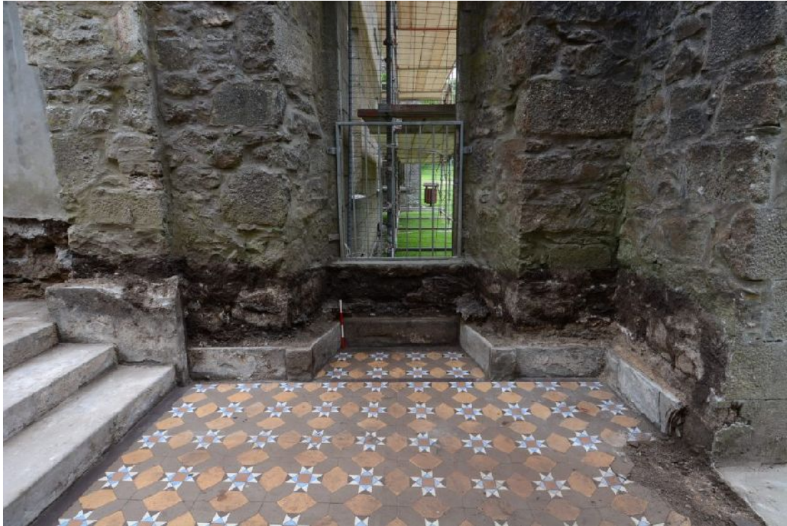
Illus 5 Tiled floor in window area of lower part of Entrance hall

A stone skirting ran around the base of the walls. This was formed of very fine light grey slate blocks set on edge and overlapping the floor tiles. The slabs were c.230mm high and varied in length between 0.60 and 1.05m. They were between 20 and 60mm thick.