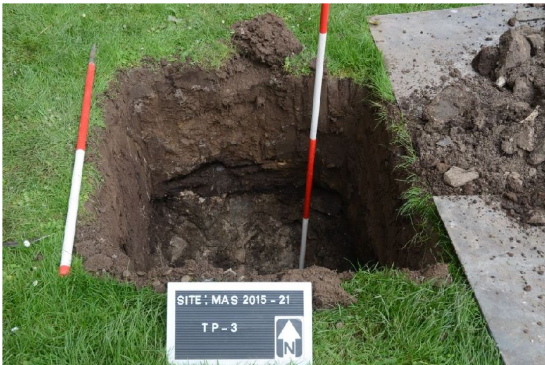
Illus 19 Section of TP3