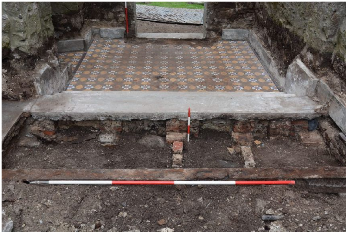
Illus 8 Entrance Hall looking S to doorway. Detail of area below step 5

The upper step (5) is clearly supported on a stone wall c. 100mm in from N edge of the step. There is further support provided by a number of brick pillars (see below). The slate skirting is continued on either side of the lower steps 3 and 4, with slabs 70 and 85mm thick. To the E of the top step (5), two slate slabs continue the slate flooring into the recess of a former door (Illus 2: Blocking 1). To the W of the top step, the thinner slate skirting is continued.