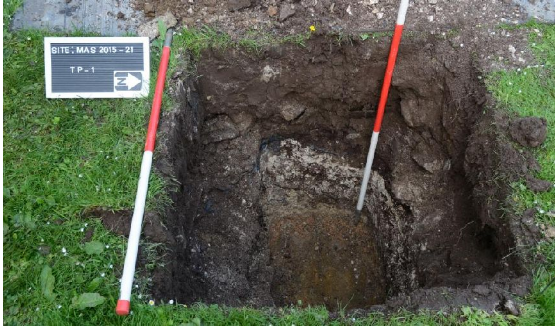
Illus 15 Section of TP1