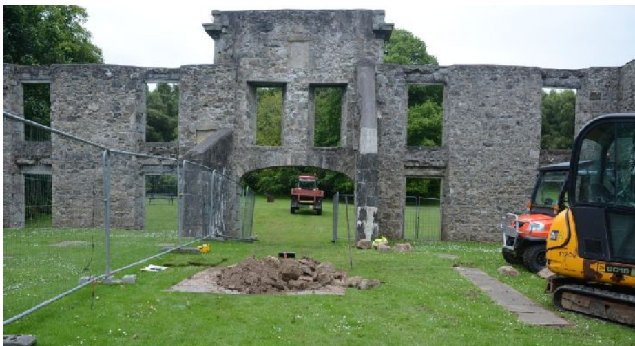
Illus 16 Location of TP2 looking E

650mm+ Building rubble. Stone, mortar, occasional brick, including a block of firebricks. Not excavated to base of rubble which was very firm and showed no evidence of voids or cellarage.