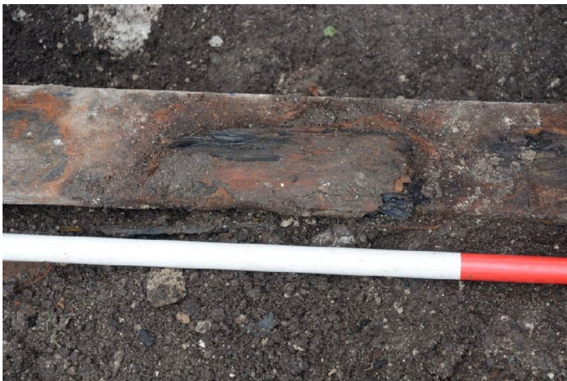
Illus 11 Detail of timber beam in situ along top of I-beam