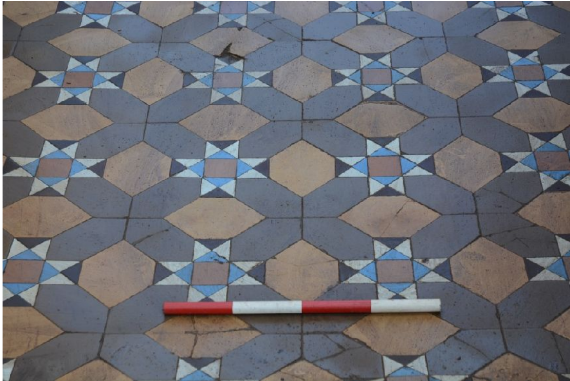
Illus 21 Detail of tiles in lower part of Entrance Hall