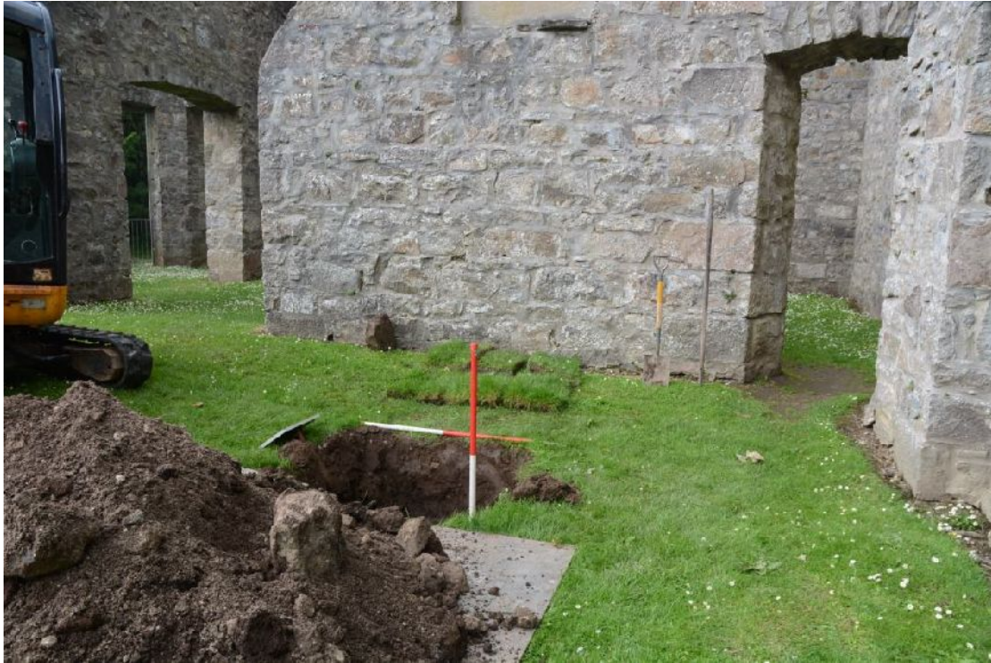
Illus 18 Location of TP3 looking W