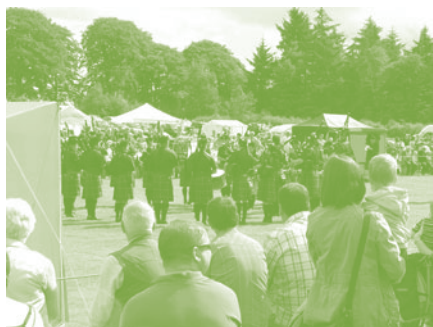
Pipe Band Competition.