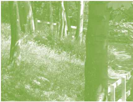
Aden Country Park.