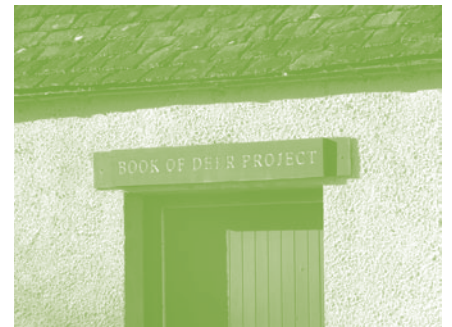
Book of Deer.

Over the last 18 months, events have been organised and actively promoted. As a result visitor numbers have significantly increased.