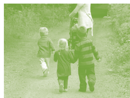
Aden Country Park.