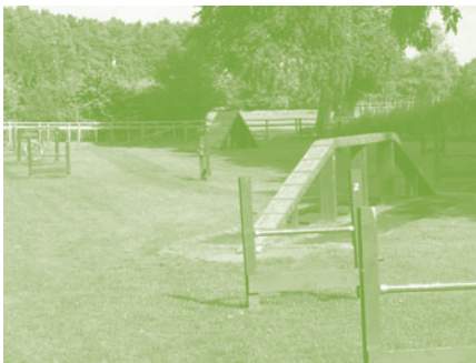
Dog Agility Area.