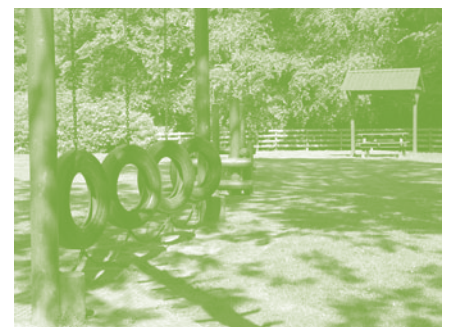
Childrens Play Area.