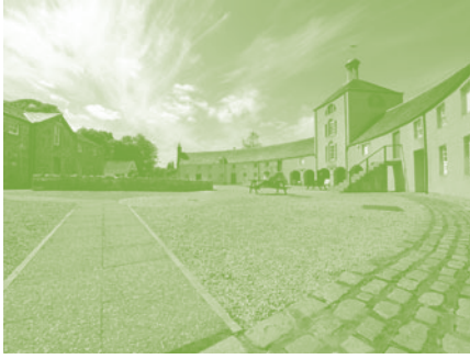
Aberdeenshire Farming Museum.