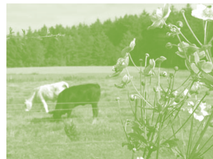
Aden Country Park.