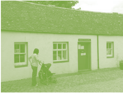
Craft Shop (Balance Crystals).