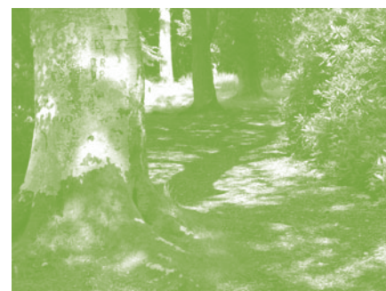
Aden Country Park.