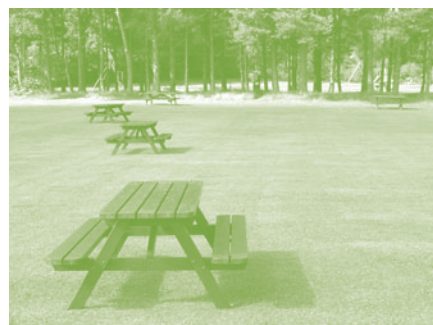
Picnic and BBQ Area.