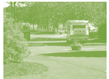
Caravan and Camping Site.