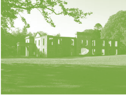
Aden Mansion House.