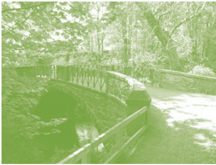
Aden Country Park.