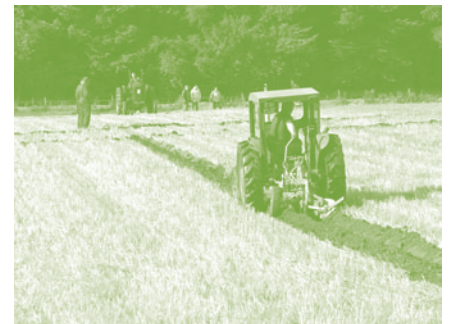
Vintage Tractor Day.