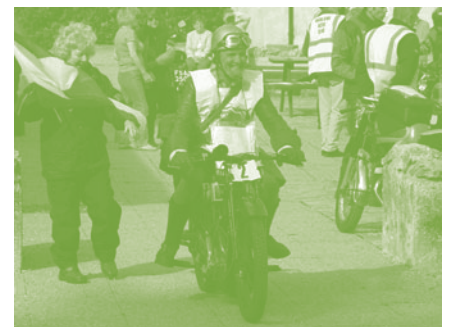
Vintage Motorcycle Event.