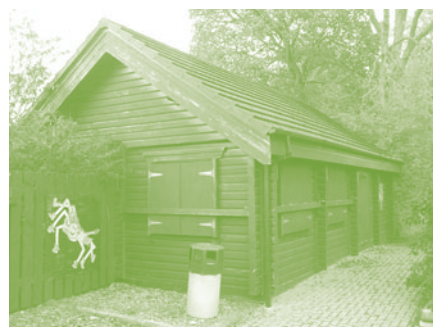
Natural History Cabin.