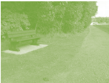
Aden Country Park.